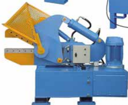
DTX 600 w/ 24" Blades Electric Foot Pedal Hydraulic Hold Down

Hydraulic Shears to suit your needs and budget. All built to the highest quality. From sizing copper tube and aluminium extrusion, to heavy materials, they are built to work.