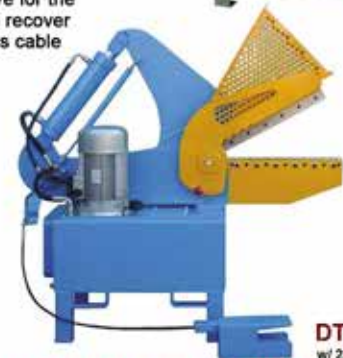
DTX 4/600 w/ 24" Blades