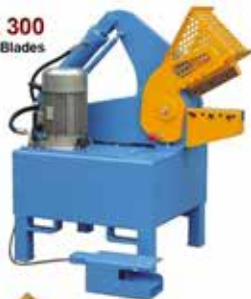
DTX 300 w/ 12" Blades