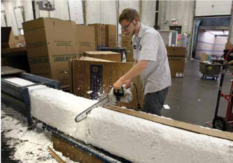
Compressed foam exits a mechanical densifier, where a worker cuts it into smaller pieces for shipment to manufacturers. The recycled material can become PS products such as crown molding, picture frames, CD jewel cases, and synthetic lumber. Alternatively, it can get turned back into EPS and used for insulation, surfboards, and packaging.

to remove contaminants before densification.